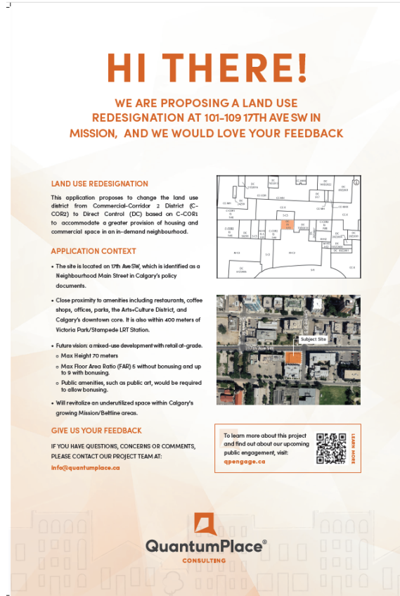
Hi There signs placed on the site